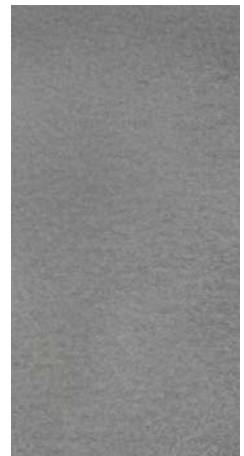
stage 5 (grey)

also available in 300 x 900 and 600 x 900