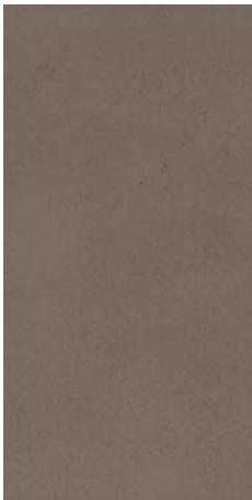
stage 1 (dark grey)