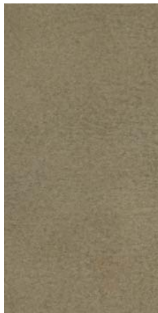
stage 3 (yellow)