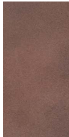
stage 4 (red)