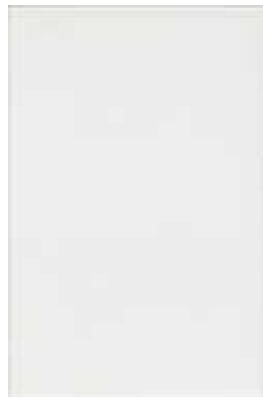
cerler blanco matt