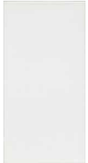
calypso blanco rectified